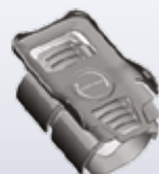
• Wearable Holder